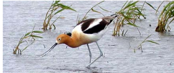
Top Left- Grasshopper Sparrow Top Right- Clay-colored Sparrow Middle: American Avocet Bottom: Gray Partridge