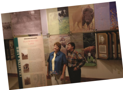
Rosebud Visitor Center