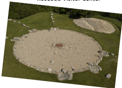
Medicine Wheel Park